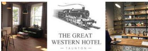
THE GREAT WESTERN HOTEL — TAUNTON —

Don't miss out on the following opportunities across to meet with fellow members, make new connections and learn something new!