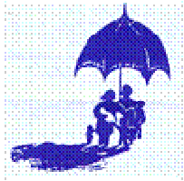
Taunton Women's Aid

*** Taunton & Pickering Golf Club are also offering the opportunity for a limited number of lucky delegates to join a coaching clinic (10 delegates) and play a round of golf (4 delegates)