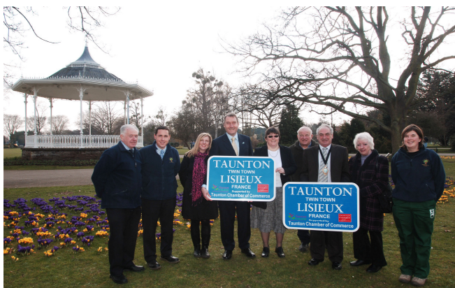
(Picture shows members of Taunton Chamber of Commerce and Taunton in Bloom presenting twinning signs to Mayor of Taunton Deane)